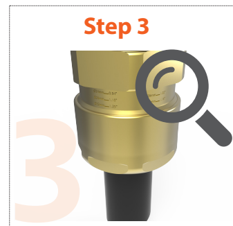
The backnut should be level with the marking guide corresponding to its diameter – this can be visually inspected and adjusted as necessary

Note: The cable gland installation instructions have a printed cable OD measure for if the cable OD is not known