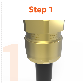
Follow cable gland installation instructions until final stage – tightening of rear seal

The gland is permanently marked with various lines/numbers indicating the correct tightening level related to the cable diameter. Following the relevant cable gland Installation Instructions, the back seal should be tightened until a seal is formed on the cable outer sheath and then tightened one further turn.