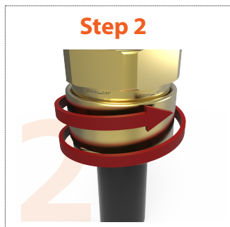
Tighten backnut until a seal is formed onto the cable, then tighten one further turn